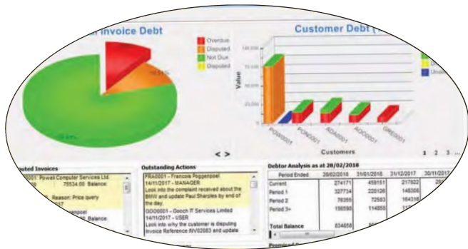
Credit Management Company View