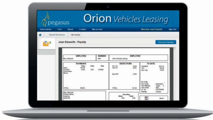
Employees have instant, secure access to their payslips

Find out how much your business can save in printing and postage costs with our ROI Calculator. Visit www.pegasus.co.uk/calculator .