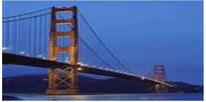
"I left my heart in San Francisco"

I suppose sharing an office with three men can be challenging; I've had to learn about cars and football so that I can join in the conversation. I tried to interest them in shoes and the sale at Debenhams but just got blank stares.